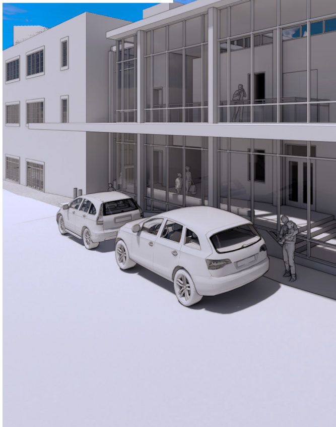
RIGHT: Accessible routing allows for the full utilization of both buildings to accommodate our growing children's ministry.