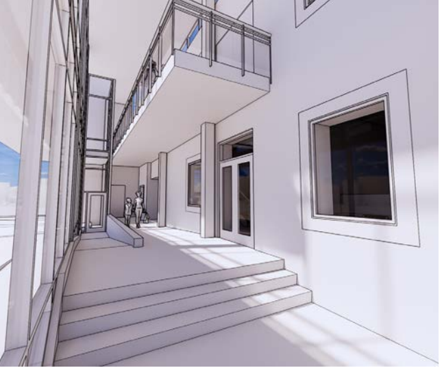
LEFT: A security-controlled building connector linking the C and D children's education buildings.