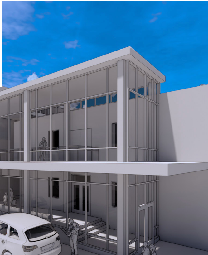
LEFT: Exterior and driveway improvements to facilitate efficient and secure drop-off.