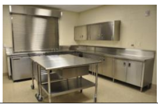
Outreach Center Kitchen: Used for breakfast preparations and for meals for weekend groups.