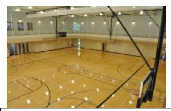
Outreach Center Gym: Available for CROSS groups at designated free times.

Outreach Center: 1073 Providence Road Charlotte, NC 28207 Main location for life at CROSS Missions!