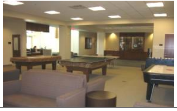
Outreach Center Game Room: Available for CROSS groups during designated free times.