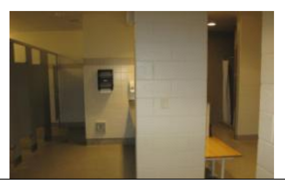
Outreach Center Bathrooms: Showers & bathrooms available on each floor of the Outreach Center.